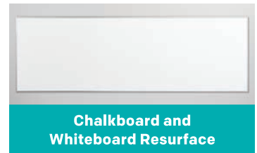
Chalkboard and Whiteboard Resurface

For installation service requests, call 1-800-328-3908 or visit 3m.com/3M/en_US/graphics-signage-us/resources/find-an-installer