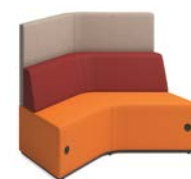
High-Back Arrow-In Seat