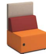
High-Back Square Seat