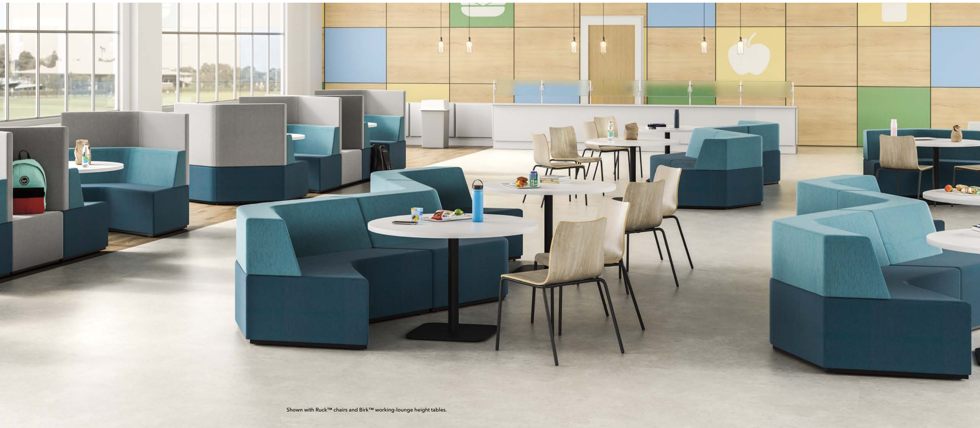
Shown with Ruck™ chairs and Birk™ working-lounge height tables.