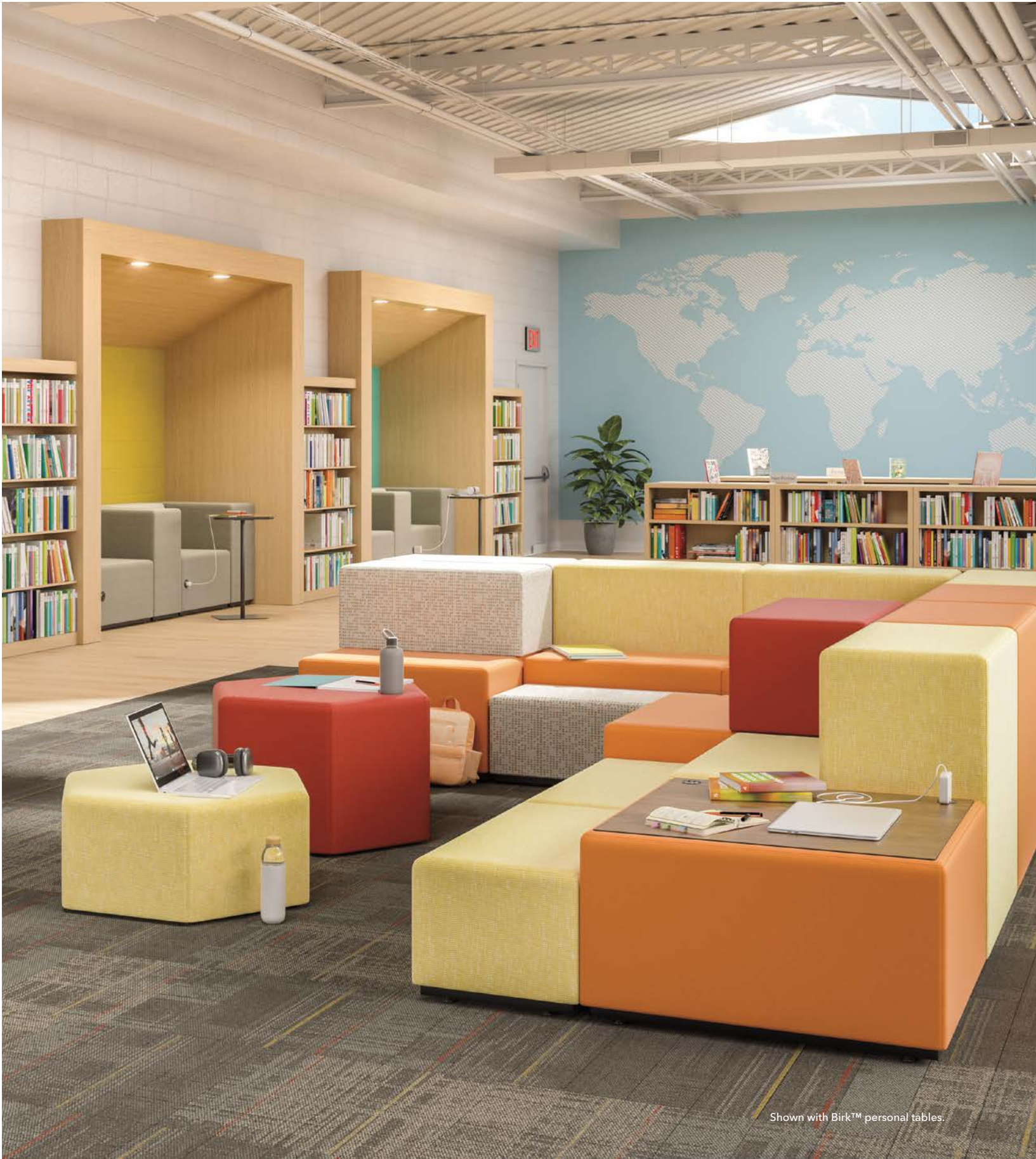
Shown with Birk™ personal tables.