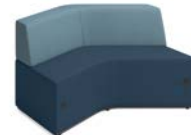
Low-Back Arrow-In Seat