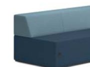
Low-Back Trapezoid Seat