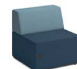
Low-Back Square Seat