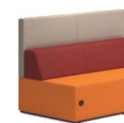
High-Back Trapezoid Seat