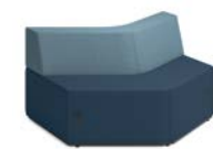
Low-Back Arrow-Out Seat